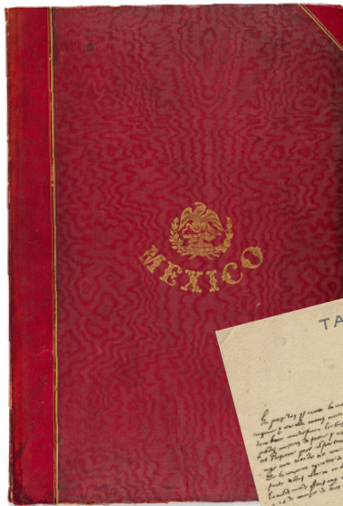
Sanchez learning the art of agave farming.