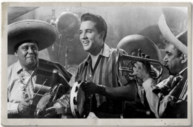
Sanchez would frequent parties of Hollywood A-listers from the 50s-60s, using Acapulco as their getaway.