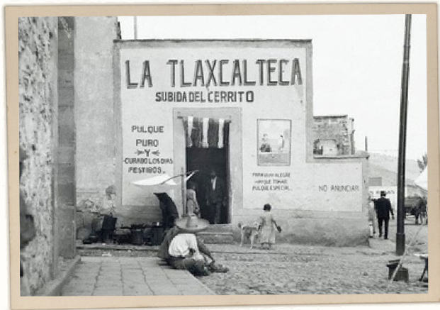
At the local bar after a day's work.