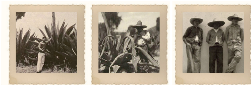
Amigos of El Primo farming agave across Mexico.