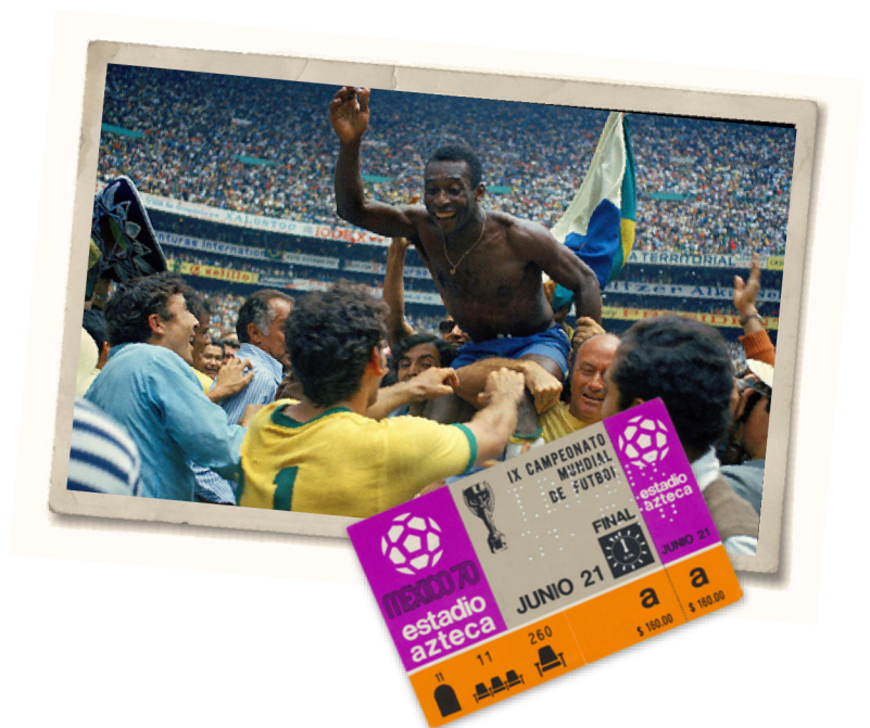
Sanchez and compadres celebrating with Pele. After a few shots of Sotol you can be anywhere we guess?